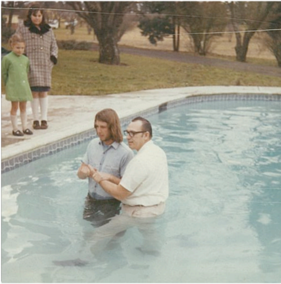
Water Baptism Feb 1972 22 years old!