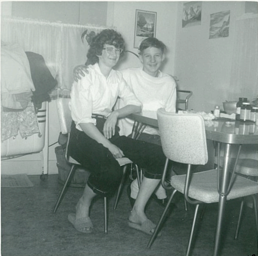
Mom & Me Dec 1963 I was 14 years old.