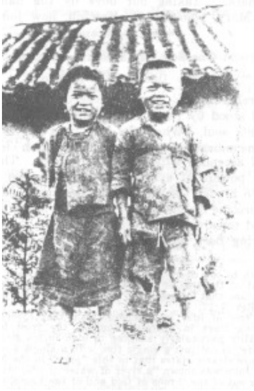
Two Young Believers