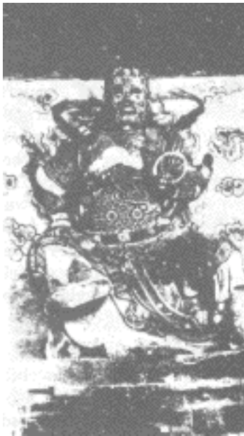
A demon idol. Some demons look something like this, and worse.

No careful observer could have been with us during those weeks of the mighty outpouring of the Holy Spirit and doubted that there are two Kingdoms in constant conflict. As surely as angels minister and the Holy Spirit leads to a real Kingdom of light, so surely do demons hinder, while the devil presides in a realm of evil spirits in a kingdom of real darkness. One kingdom was made as certain to us as the other. Man was clearly revealed as the battle ground.