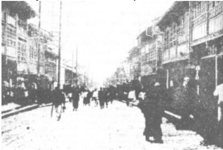
The scenes of this city are not so clear, the children said, as the scenes they saw on the street of the New Jerusalem in heaven.

Why should not the New Jerusalem be a real city with streets of real gold and with jasper walls and with foundation stones of precious jewels? Did God so exhaust his material when he made the universe that he had no gold or jewels left for heaven? If God could make a world, could he not suspend a city in the sky beyond the stars? Here and there a little impure gold in a fissure of a distorted rock of this cursed and perverted earth or here and there the discovery of a precious jewel hidden in the debris of earthly ruins are only lingering reminders of the reality of which these are merely shadows. The real, the imperishable are in the city whose builder and maker is God.