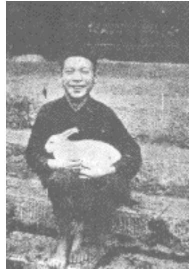
Of such is the Kingdom of Heaven. There is a mutual love in all of God's creation there.

There is a city that never gets dark, nor does it need the sun by day or the moon by night. Its golden streets require no sweeping. Its jewel-bedecked dwellings need no repair. There is a city that has no doctor signs, no diseased and disabled, no sickness or sorrow; a city with no crepe on its golden doors, no funeral processions on its golden streets; a city where melancholy and all mourning is done away; a city where all death has been swallowed up by life and that more abundantly; a city of pure unbounded joy. There is a land of unclouded day where storm clouds never rise. In that happy land there is no bread line or struggle for survival. There is no selfish competition. There is no self-seeking to engender unloving suspicion. No one is anxious as to what he shall eat or what he shall wear. The garments of white will never grow threadbare. The trees with the fruits of life will never be barren.