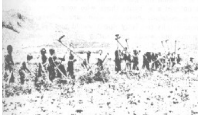
The Adullam boys are normal boys. They are able to dig their end of a hard row.

In all the succeeding weeks God proved that promise true. Since He had proven that promise to us before, it set us free from anxiety as we saw and heard the wonderful things of God that took place in our midst, every day different, one wonder succeeded by another, as our wonder working God took His Adullam refugees from stage to stage and from glory to glory in His school of the Holy Spirit.