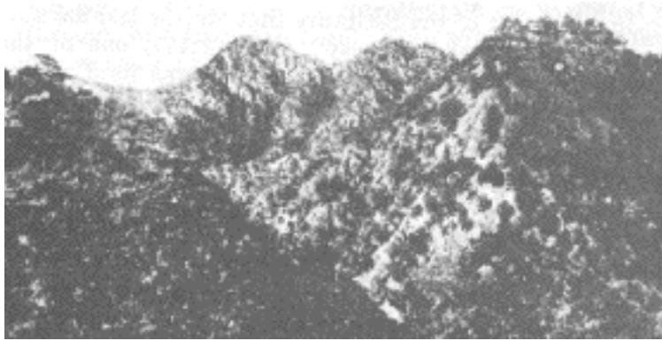
Ka Do Land Mountains

still be in the city of God, the Bride of the Lamb. 64 It was the earth God wanted for His children, more than restored by Him who is more than Conqueror. It was the New Heaven and the New Earth that had passed through the new birth 65 and that will never pass away, the earth where God will again pitch his tent with men, where he will forever be called their God and they shall all and always be His Children. Amen.