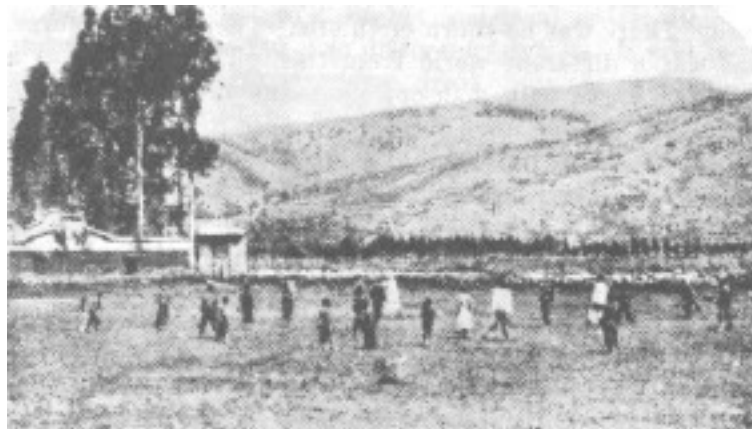
ADULLAM BOYS AT PLAY

Before telling about the visions of Paradise we wish to show that such a Paradise as these children saw is in accord with the Father's plans for his children, as revealed in his written word. When the Lord created the first perfect man and his perfect bride he "planted a garden eastward" in Eden, in which he put the man whom he had formed. "And out of the ground made Jehovah God to grow every tree that is pleasant to the sight, and good for food, the tree of life also in the midst of the garden" (Gen. 2:9). Hence, in the beginning, the Lord planned for man to dwell in the midst of all the beauties of nature. He was given a home in the garden in the eastern part of Eden, the wonder "park" that God himself planned and planted. In that order there was no sin. There was no sickness or death. There was no thorn or thistle. There was no curse. That was a different world from this. That world was a heaven on earth with man enjoying what might have been eternal life, in dominion over a whole world of trees and flowers "pleasant to the sight," a whole world of beauty and glory such as the present earth has never seen. God planned all these things for man's eternal happiness.