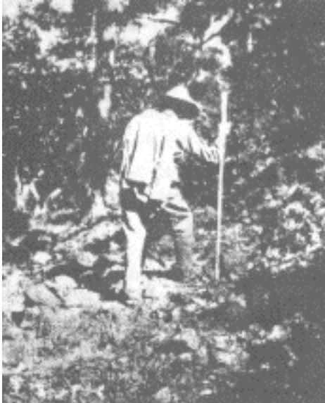
One hour in Paradise will reward all the toils of the way.

heaven. The finest instruments of music that have been made on earth, from the days when the sons of Adam began to "handle the harp and pipe" until the present day, are as mere imitations of the trumpets, the harps, and the instruments upon which "the lost chords" are restored in the golden city and upon which all the music of the liberated soul can find its fullest expression.