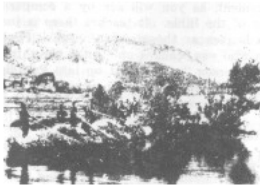
Adullam boys enjoying themselves by still waters. They believe that when they at last leave earthly scenes of beauty it will be to enjoy more surpassingly wonderful scenes in the Eden in the New Jerusalem above.

smallest children, who were naturally most ignorant of these matters, were our best teachers. That they got these things from the Lord is clearly evident, as you will see by a comparison with the teaching of the Bible. It teaches there is just such a Paradise in heaven as these children saw. Paul said he knew a man who was "caught up even to the third heaven" and that this person "was caught up into Paradise ." 29 In the messages of Revelation "the Spirit saith to the Churches, to him that overcometh, to him will I give to eat of the tree of life, which is in the Paradise of God" (Rev. 2:7). Of the heavenly scene we are also told that "on this side of the river and on that was the tree of life bearing twelve manner of fruits." 30 Hence there is a Paradise in heaven with flowing water and trees of fruit.