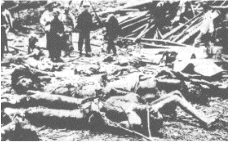
THE GREATEST SUPPER ON EARTH

"Thus saith Jehovah of hosts, Behold, evil shall go forth from nation to nation, and a great tempest shall be raised up from uttermost parts of the earth. And the slain of Jehovah shall be at that day from one end of the earth: they shall not be lamented, neither gathered, nor buried; they shall be dung upon the face of the ground." Jer 25:32, 33