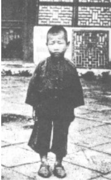
MOSES The Lord baptized him with the Holy Spirit according to the Bible pattern

No one present at the time has ever doubted that the Lord spoke to us by direct inspiration in the first days of the outpouring of the Spirit when He spoke through one of the smallest and humblest of the children. There was something about the voice, the penetrating power of those words, a heart-gripping power that cannot be described. We had never heard such a gripping voice from God in any sermon in all our days. We all knew we were hearing directly from the Lord. Quite a number of the Adullam people later spoke in prophecy, insomuch that we marvelled more and more at the miracles that were taking place as the Lord spoke the wonderful things of God, revealing His plans and purposes in picking the outcast "nothings" of the earth, who were recent beggar boys, to make them the mouthpieces of the living God, speaking through them by direct inspiration, edifying and building up this little group of simple blood-washed believers so recently saved out of hopeless physical and spiritual despair.