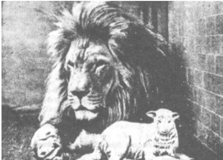
The lion and the lamb will lie down together. Fierce and ferocious nature will be regenerated to a higher plain than it was even in the beginning when all was "very good."

Similar and surpassing beautiful scenes in Paradise were seen, repeatedly seen, by a large number of Adullam children. In Paradise they saw trees bearing the most delicious fruit, and vistas of most beautiful flowers of every color and hue, sending forth an aroma of surpassing fragrance. There were birds of glorious plumage singing their carols of joy and praise. In this park were also animals of every size and description: large deer, small deer, large lions, great elephants, lovely rabbits, and all sorts of little friendly pets such as they had never seen before.