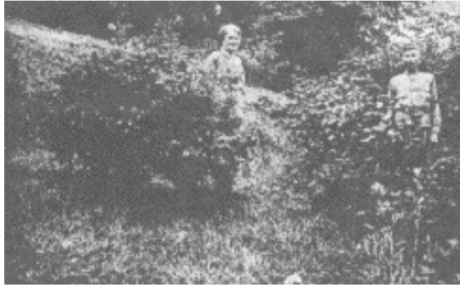
Home At Last