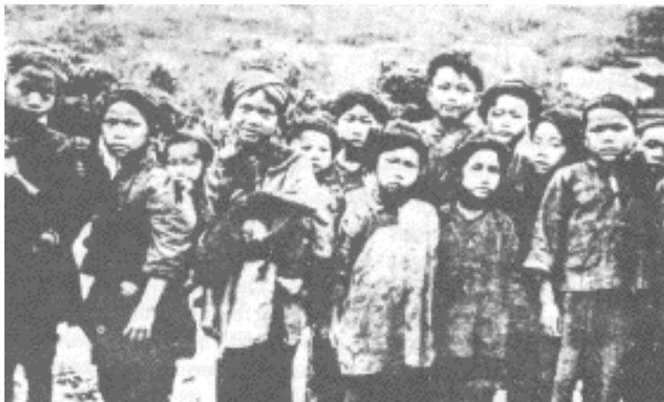
Tribal Children in China

In this wicked age, in the midst of this present unbelieving, perverse generation, the Lord can and will prove that what He has written in the Bible is the word of the living God. He can and does move in the midst of a believing people in supernatural ways through gifts of the Holy Spirit, confirming the word with signs following (Mark 16 :15-20) .