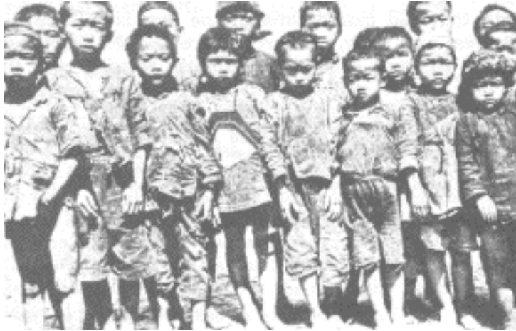
Beggar boys who found a home in Adullam Orphanage

In fulfilment of the Scripture that "in the last days. . . your sons . . . shall prophesy" (Acts 2 :17), one of the little ten-year-old beggar sons of China was used as the mouth-piece of the Lord to bring us a message by direct inspiration .