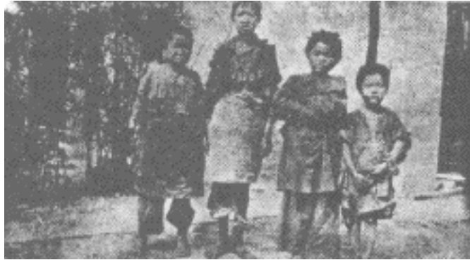
Some more of the "despised"

While the wise of this learned (?), proud, and stiff necked generation that resists the simple Word go on groping around in the darkness of their own self-sufficient delusions, it must be true in this day, as in the past, that in the midst of so much confusing of man's wisdom, Jesus can still say, "I thank Thee, O Father, Lord of heaven and earth, that Thou didst hide these things from the wise and understanding, and didst reveal them unto babes" (Matt. 11 :25).